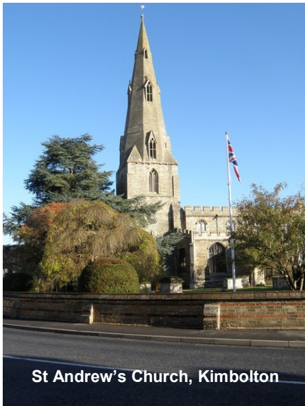
St Andrew's Church, Kimbolton