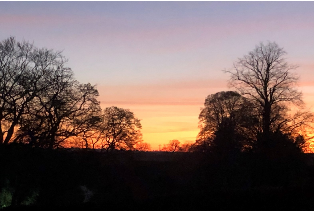
Thanks to Lynda Moore for this lovely sunset shot taken from The Bar, looking west.