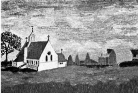
1965 Moorhouse Church. The last Harvest Home