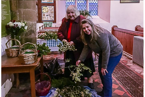
Thank you to the ladies who prepared the church for Christmas. It looked beautiful.